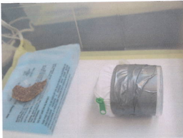
Figure 1. Test Layout

The materials and methods were as described in protocol N4210112033A410 (APPENDIX I). A layout of the test arena is shown in figure 1. The bed bugs were placed in the plastic container and had to escape through the double zipper casing secured to its rim to reach the heating pad and filter paper scented with bed bug odor (Fig. 1 & 2).